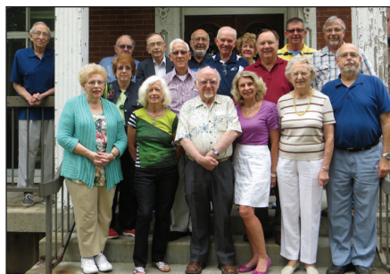
The 2014-2015 AUAR Board

The AUAR Newsletter is a biannual publication of the Association of The University of Akron Retirees (AUAR), c/o Talent Development & Human Relations Department, The University of Akron, Akron, OH 44325-4730.