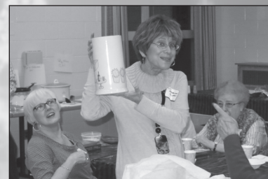
We have a Winner!