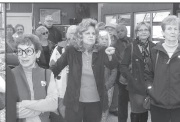
Checking out Portage County History