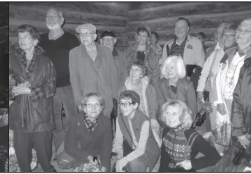
Modern day explorers in the modern day cabin at Indian Village