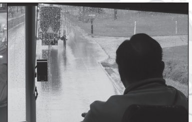
Why can't we get a closer look?

What better way to conclude our day trip than to have a wine tasting. So off we headed to Halliday's Winery, which is located next to scenic Lake Milton State Park in Mahoning County. Here we sampled 8 wines and learned about how this 2-year-old establishment came to be and its connection to the nearby Olde Dutch Mill Golf Course. After purchasing our wines to take home and enjoy, we boarded our Baron's Bus Company coach and returned to Summit County via I-76.