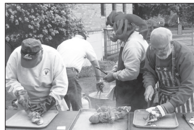
The Lobster Men at work