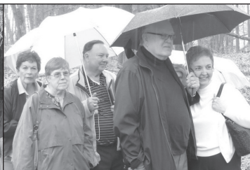
Rain or shine the AUAR spirit is to explore