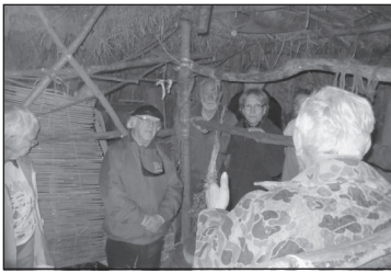
Exploring a community shelter at the Indian Village