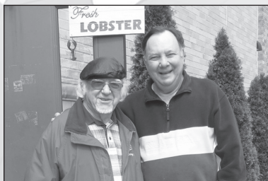
The official start of Lobster 2014

Now that we have held the annual Lobster & Suds event at Zwisler Hall on Mull Avenue (St. Sebastian Church) for the last three years, things have settled into common practices and routines. Seventy-five AUAR members and guests attended the 2014 event. That was one of our larger crowds. The weather was ideal, and the lobster cooked to perfection. The Parmesan Chicken, prepared by UA Dining Services was moist and plentiful.