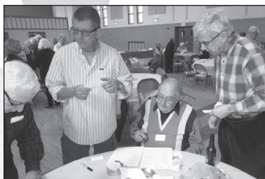
We begin with the numbers