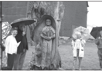
Appreciating the Crafts