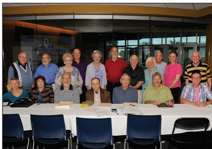
The 2014-2015 AUAR Board

The AUAR Newsletter is a biannual publication of the Association of The University of Akron Retirees (AUAR), c/o Talent Development & Human Relations Department, The University of Akron, Akron, OH 44325-4730.