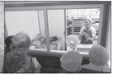
So that's how it's done

The annual "Road Trip" was held on April 25, which was a mild but wet spring day. A nice group of 33 retirees and friends trekked by chartered bus to several places in Portage, Geauga and Mahoning Counties.